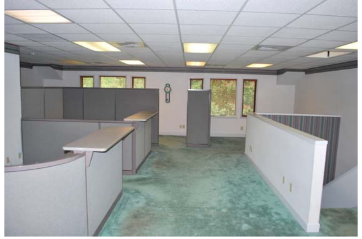
INTERIOR VIEW 2