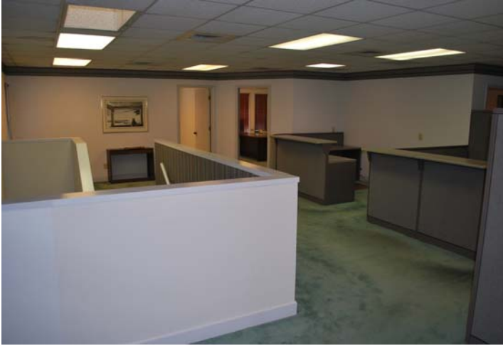
INTERIOR VIEW 1