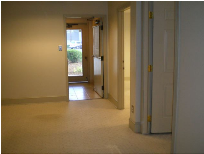
ENTRY & RECEPTION AREA