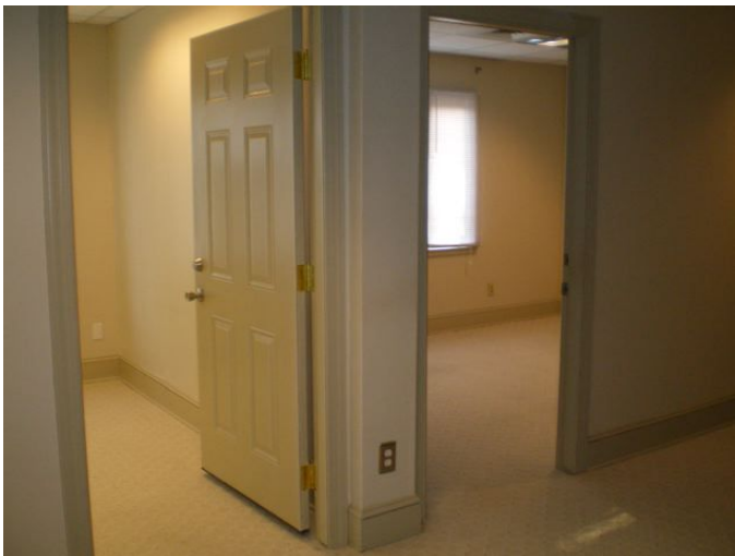
TWO PRIVATE OFFICES WITH BAY WINDOWS