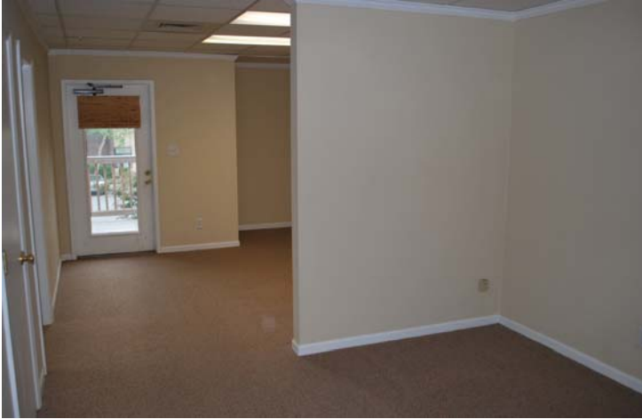
ENTRY & RECEPTION AREA